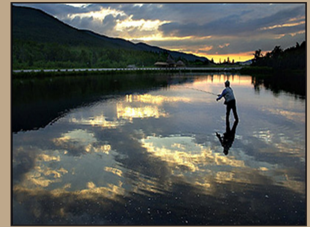
A must read for anyone living along or planning development* along the Saco, Ossipee or Little Ossipee River.

It is impossible to overstate the value and importance of clean water for people and wildlife. We can't live without it. Our health, quality of life and economy depend on it.